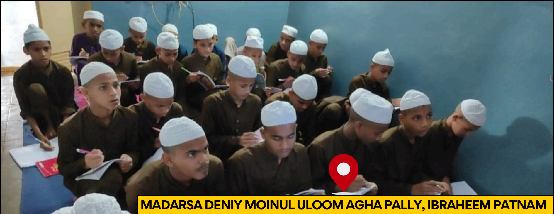
MADARSA DENIY MOINUL ULOOM AGHA PALLY, IBRAHEEM PATNAM